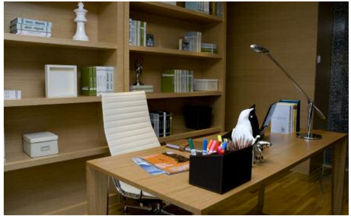
A desk in the commanding position helps strengthen your office's feng shui.

ith home offices common in many homes these days, what are the secrets to making a functional, well-designed, and highly creative space for your business? And what are common feng shui mistakes that many Bay Area entrepreneurs make when setting up an office at home?